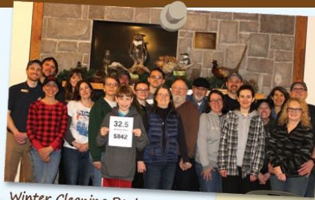
Winter Cleaning Party 2019

Spring hours begin Wednesday, March 4, 2020, Wednesday – Sunday, 10 am to 4 pm