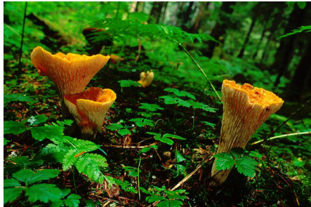
There's gold in them thar hills! Come to Mysterious Mushrooms on October 14 and learn to find some for yourself.

Here at the Tillamook Forest Center, we don't let the rain slow us down. In fact, we're as busy as ever preparing for an autumn full of activities, artwork, and abundant celebrations of the season. From September 12 - November 25 , Unnoticed Treasures showcases a collection of forest-inspired pottery and watercolors by Adrienne Stacey. On September 29 , lend the forest a helping hand at the SOLVE Wilson River Cleanup.