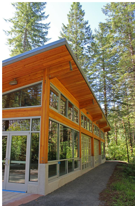
Be part of the fun for the first event in the new pavilion at the TFC.

We have great things to celebrate this fall and we hope you will join us for the festivities at the Root Ball on September 22. Your generous support--whether you are community members, part of a foundation, or a granting organization--made the Forest Education Pavilion a reality!