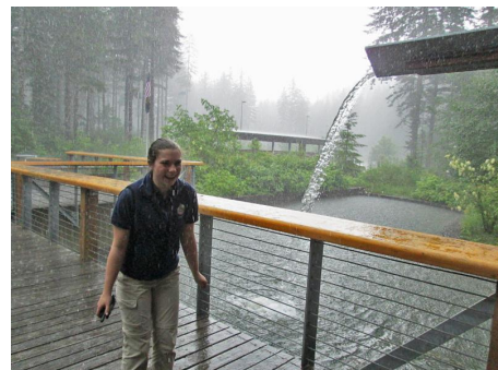
Join us in the pursuit of puddles at our Rain Festival, November 17 & 18.