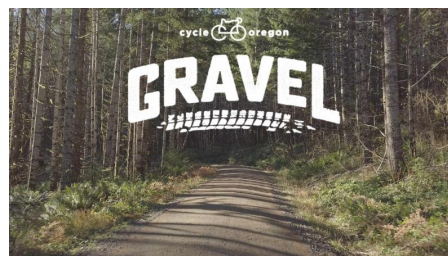
Cycle Oregon's Gravel Ride will feature short, medium, and long routes each day, traveling exclusively over gravel roads in the Tillamook State Forest.

If you'd rather experience the forest on two wheels, join Cycle Oregon for the two-day Gravel Ride, October 5-7. Gravel riders will have the whole Cycle Oregon experience - tents, showers, route support, main stage, and beer garden. For more information, visit