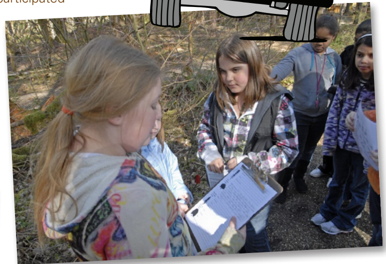
Students do a tree report in the Trees of the Tillamook program.