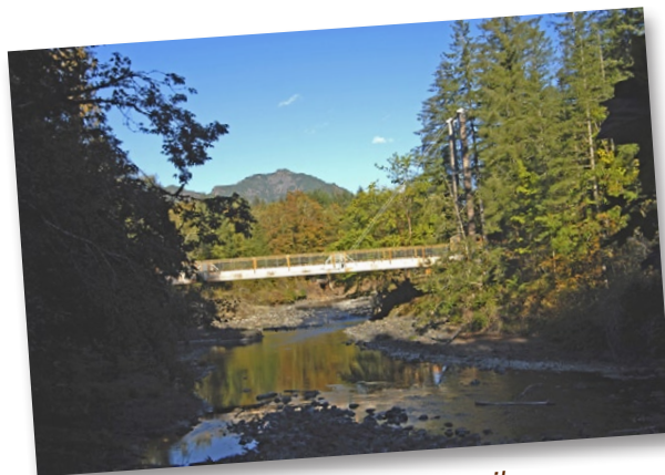
The view from the new overlook trail.