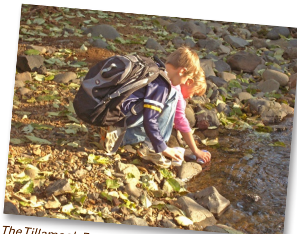
The Tillamook Forest Center provides many opportunities for nature play.

During the week of September 24 – 30 we will have a special focus on nature play during Take a Child Outside Week . We hope you will join us.