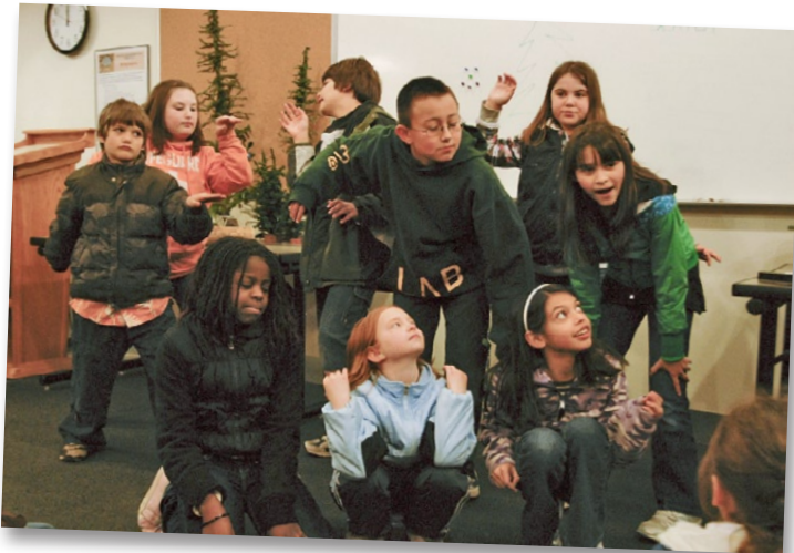
Students act out forest succession.

Self-guided visits have been valuable as well. These groups are given an orientation to the center and then guide their own activities. Many teachers find this is a great opportunity to design a field trip that best fits the educational needs of their students.