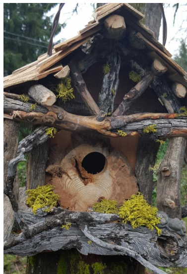
Join us in May for an exhibit of Forest Homes: quilts, bird resorts & feeders. Just one of our many special events for this year.

Over the past 10 years, the TFC has grown and deepened its roots in the community. For our 10 th anniversary, we celebrate the stories of the forest and the people who laid the foundation for the center's success.