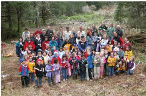
12 years ago...

During an Arbor Week event in April of 2004, students from Forest Park Elementary and Saint John Fisher School planted trees with ODF staff and some of the original tree planters who reforested the Tillamook Burn. Twelve years later, the hemlocks they planted are now thriving along the old powerline corridor and can be seen at the end of the Lookout Loop Trail.