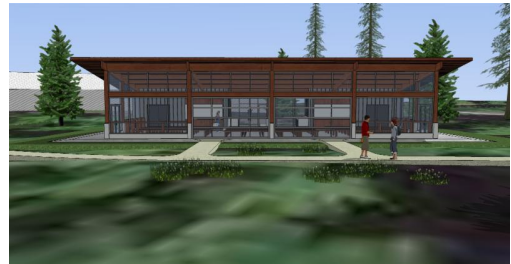
Architect concept for the proposed education pavilion.

Tillamook Forest Center Pavilion Project - The Trust is partnering with Center staff to raise needed funds for construction of this signature addition to our facility. The pavilion will greatly enhance our ability to host students during the wet season, and provide a welcoming space for visitors as well.