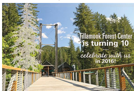
Many special events are in the works for our 10th anniversary year.

Oregonians continue to work towards a common goal: managing and appreciating these valued forestlands.