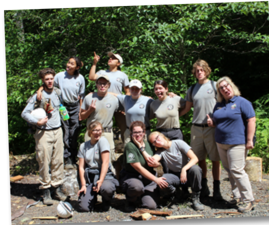
Volunteer service aids in providing for the public

Closer to home, our staff worked with local artists to display our community's creative talent in woodwork, paint, and wax. Equally talented volunteers spent hundreds of hours