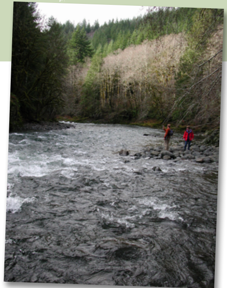
Come out and find yourself walking along the Wilson River.

Another big change beginning in 2018 is that the center will be open Wednesdays through Sundays (closed Mondays and Tuesdays) March - November due to budget and staffing restrictions. While this reduces our hours open to visitation in summer, it ensures the greatest possible customer service during our operating hours.