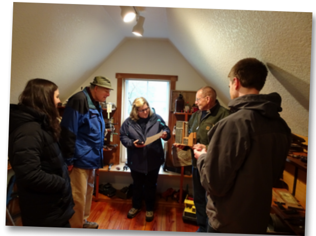
Discovering more about our historic forest community at the Reeher Homestead

hosting visitors, cleaning and clearing trails, and taking care of public spaces. Enhancing our community understanding further, staff attended the Grand Ronde Cultural Symposium and worked with the Confederated Tribe of Siletz, strengthening our relationships with tribal nations.