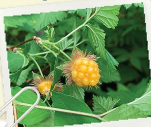
The first berry.

6/9/2021 - Bold orange columbine, tiger lily, and honeysuckle flowers are prominent on the Tillamook Forest Center trails. Berries are coming in green. With a patient gaze, I spot a single ripe salmonberry. It is not long now until the berries are plentiful.