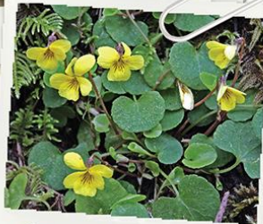
Spring flowers arrive.

4/30/2021 - April delivered dazzling warm and dry days. The rain gauge recorded just 2.22 inches of precipitation for the month. In contrast to the 9.36 inches in 2019 and the whopping 17.04 inches in 2018, this April fell short.