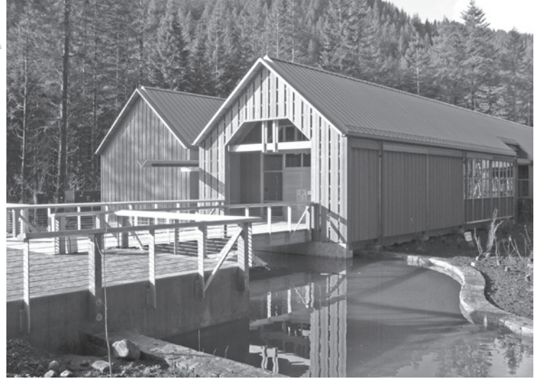
Center construction is nearly complete and exhibit installation begins soon. The view above shows the front entry and fire pond area.

ing wildfires in the 1930s and 1940s, is regarded as one of the largest forest planting efforts ever undertaken. Following the fires, thousands of Oregonians, many of them schoolchildren and volunteers, helped plant more than 72 million Douglas-fir seedlings across the blackened landscape.