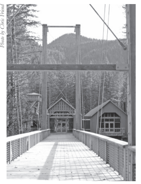
Looking across the suspension bridge toward the north doors. Note lookout tower on left.

ing foundations, individuals, business and organizations—have contributed to the project. Admission to the Center will be free.