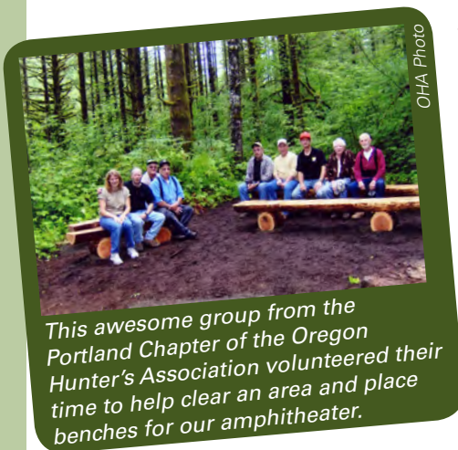
This awesome group from the Portland Chapter of the Oregon Hunter's Association volunteered their time to help clear an area and place benches for our amphitheater.