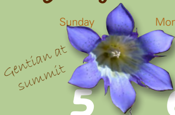
Gentian at summit