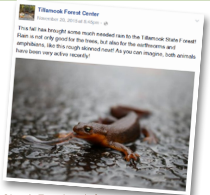
Check Facebook for fun forest happenings.

Find links to Picture Posts at: www.tillamookforestcenter.org/press_03.html