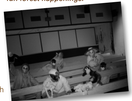
Caught in action – TFC staff test out the new trail cam!

We're also one of Oregon's only Picture Post sites. Check out our feed for this national environmental climate monitoring project where we catalog weekly photo panoramas from three locations around the site. Other updated features on our website will keep you connected too; view live feeds from our tower and river webcams and browse new items featured on our gift shop page.