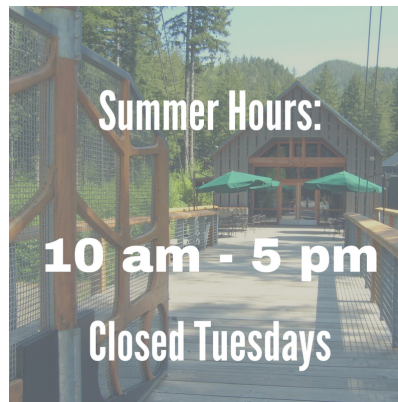
Summer hours run Memorial Day to Labor Day

Fall hours will remain unchanged, with free public access to the center from Wednesday through Sunday, 10 a.m. to 4 p.m. from the week after Labor Day through the end of November.