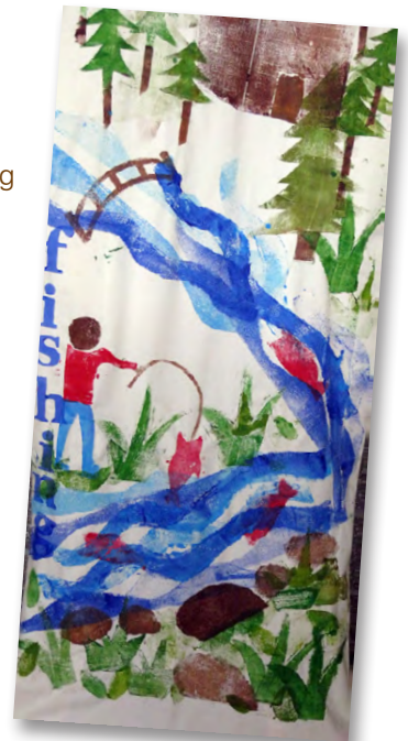
Springville School's forest artwork will be on display at the Center in late March and April.

Our collaboration with students is building essential job skills and creating long-lasting relationships that foster feelings of ownership, responsibility, and pride. By combining our strengths and capabilities, the Center is able to achieve more objectives than we could do alone, and bring exciting change to the typical school curriculum as well as the community.