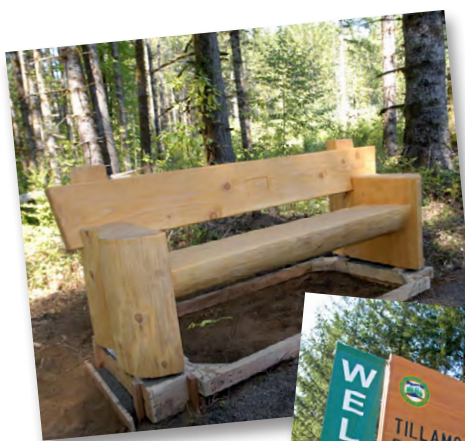
A South Fork Crew installed new benches at the Center (above). Our newly refurbished sign welcomes visitors back after a winter closure (right).