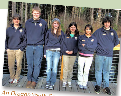
An Oregon Youth Conservation Crew provides valuable assistance to Center operations.

March and, perhaps you can join us for our tree planting event on April 3 rd . Then, too, on any day you visit (Wed-Sun, 10-4), I know you'll be impressed, again, with the beauty of the Tillamook State Forest and with the quality of our facility and program at the Tillamook Forest Center. This Center is a very special place, freshly re-opened for the new year, and, it really does sparkle!