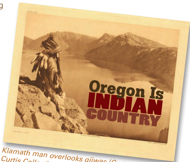
Klamath man overlooks giuwas (Crater Lake)

Check our online Program & Event Calendar for details on the presenter schedule, along with other events.