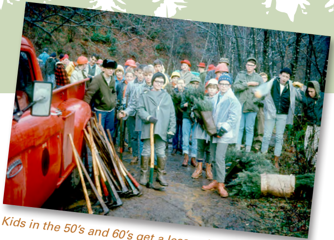
Kids in the 50's and 60's get a lesson in tree planting

Last April, the Tillamook Forest Center and the Oregon Department of Forestry helped commemorate Oregon's Sesquicentennial — 150 years of statehood — by sponsoring The Great Oregon Tree Plant, an event that recognized Oregonian's efforts to plant trees and promote stewardship of our forest resources. It was so well received that we have decided to make tree planting an annual event, timed with Oregon Arbor week and the Tillamook Forest Center's anniversary.