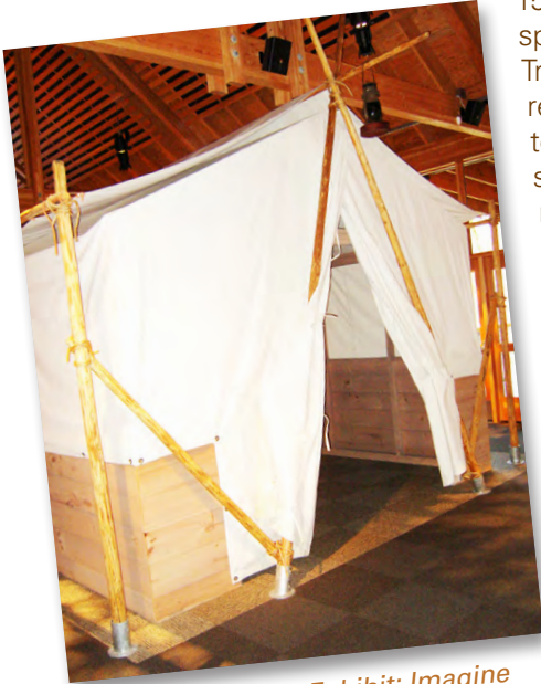
Tree Planters' Tent Exhibit: Imagine planting trees all day in the Burn and returning "home" to a 12-man canvas tent— during the coldest part of the winter!

Tree planting is our legacy! Sixty years ago, a great experiment in reforestation began in earnest in the Tillamook Burn. At the time, it was heralded as the largest reforestation project in the world! 24 years later, more than 108,000 acres were planted with 72 million, two-year-old seedlings. In addition, 116,000 acres were seeded from the air. Over time, the Oregon Department of Forestry and citizens' hard work transformed a blackened landscape to the Tillamook State Forest that we all enjoy today.