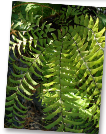
Left: Look for black-stemmed Maidenhair fern on your next hike in the Tillamook.