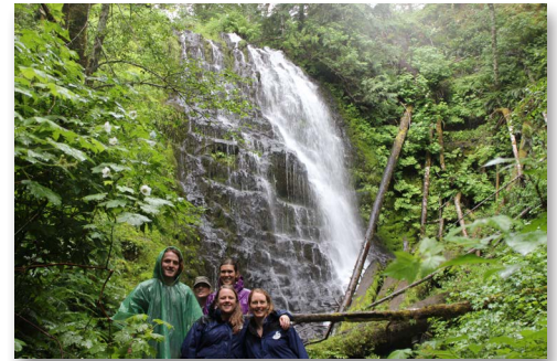
Top: The 2013 summer staff on a hike to the majestic University Falls.

So, next time you're itching to get out and experience the earth, remember that no matter the season, you don't need a passport to explore the wonders of a temperate rainforest.