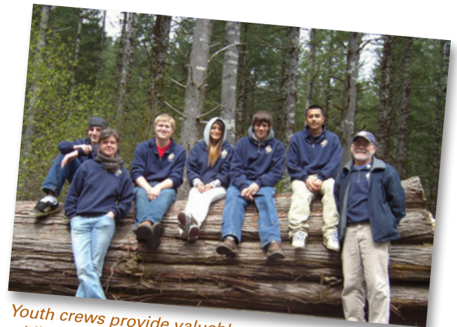
Youth crews provide valuable support to the Center while also giving students valuable training and work experience.

We're extremely fortunate to have this broad support from our community partners, volunteers and the Tillamook Forest Heritage Trust. Their support will allow thousands of additional visitors to enjoy the Center and learn more about this beautiful State Forest.