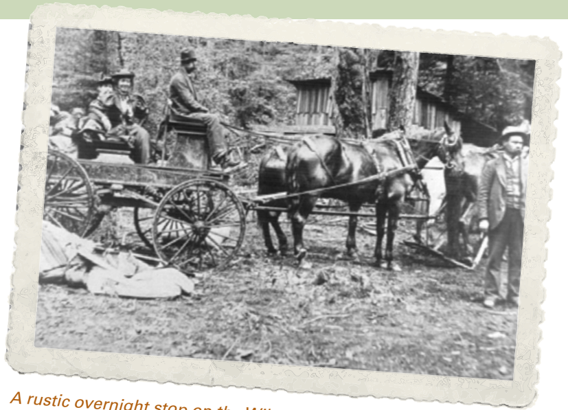
A rustic overnight stop on the Wilson River Wagon Road – McNamers Camp. This site is easily accessible on Highway 6 (MP 27.8) just west of the Elk Creek Campground access road. Look for the large pull-off and dirt road between the highway and the river.

The contract for mail delivery required daily service which proved extremely challenging during frequent heavy snows at the summit during the winter. A way station was constructed near Trask Mountain called the Summit House to provide fresh horse teams to the stage line and as a possible lay-over for the mail carriers during the harsh winters. Use of the Trask Toll Road was limited due to the steepness of the route and narrowness of the road. It could accommodate small freight wagons and countless stock drives, passengers, and mail bags made their way over the 45-mile trek.